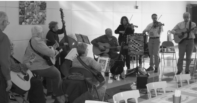
The "Downhome Band" from the Wanamingo area entertained our members prior to the start of the business meeting.