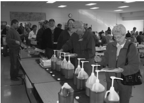
Over 300 people enjoyed Dad's Belgian Waffles prior to the start of the meeting.